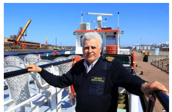
Captain of «Hercogs Jekabs» vessel

"Installed equipment allows controlling fuel consumption, as well as preventing any fuel manipulation. Solution gives us opportunity of day and night control and ability to avoid breakdowns, fuel leaks and unnecessary payments. Installation of equipment was made on time and with the highest level of competence."