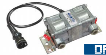
Fuel flow meter DFM 250D

Consumption per chamber ..... 50 – 250 L/h Max. pressure ..... 25 bar Power supply voltage ..... 10 – 50 V Working temperature ..... -40 .. +85 °C