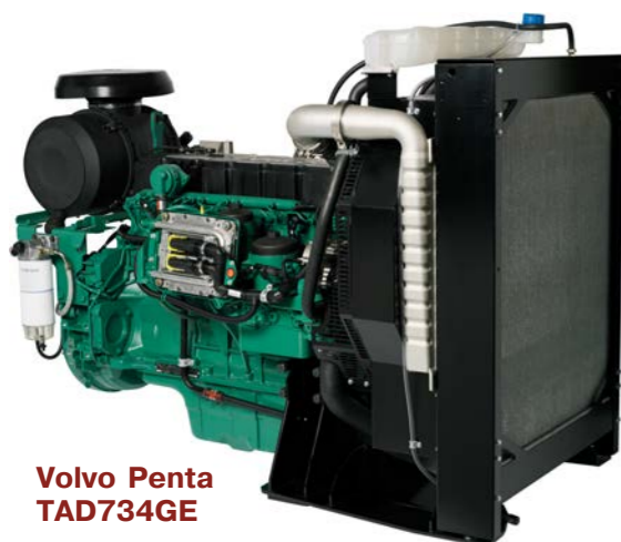
Volvo Penta TAD734GE

Diesel generators are equipped with Volvo Penta TAD734GE engines with power of 363 h.p. Engine is six-cylinder, working volume – 7,15 L, with in-line arrangement of cylinders and injection system with electronic control of Common rail injectors.