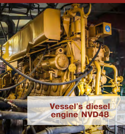
Vessel's diesel engine NVD48

Fuel consumption is accounted using calculation method. Fuel consumption quota is registered in regulatory documentation, which hasn't been updated for a long time.