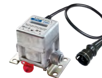
Расходомер топлива DFM 250CCAN

Information from tracking device is sent to dispatch service's computer in real time. All data is represented clearly on virtual dashboard of ORF4 telematics service. Dashboard's flexible interface allows to display data in any convenient form: charts, figures, arrow indicators, scales.