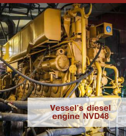
Vessel's diesel engine NVD48

Fuel consumption is accounted using calculation method. Fuel consumption quota is registered in regulatory documentation, which hasn't been updated for a long time.