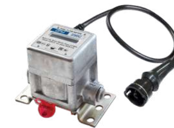
Fuel flow meter DFM 250CCAN

Information from tracking device is sent to dispatch service's computer in real time. All data is represented clearly on virtual dashboard of ORF4 telematics service. Dashboard's flexible interface allows to display data in any convenient form: charts, figures, arrow indicators, scales.